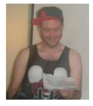
Joint winners of best Newcomers – Heroin and Dope