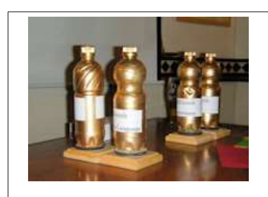
Prestigious QH3 2014-Awards