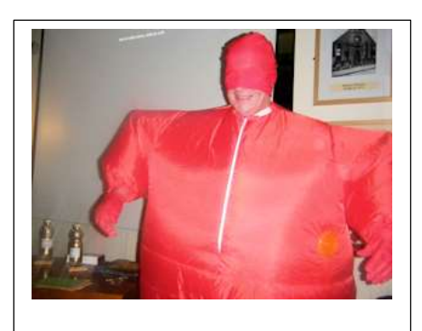
Guest present for best newcomer – Big Fat Red Man