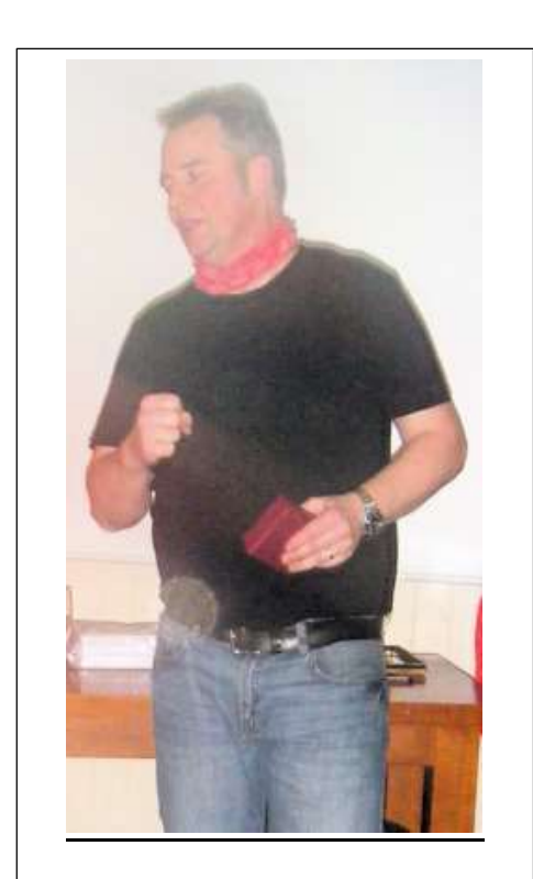
Master of ceremonies and QH3 GM, B*gger