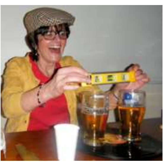
Current Beer Mistress Malteaser with a lot to learn